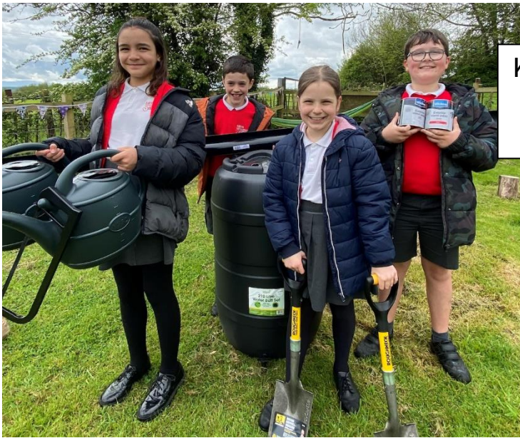
Keevil School pupils with gardening equipment donated by Wickes for use in their Forest School