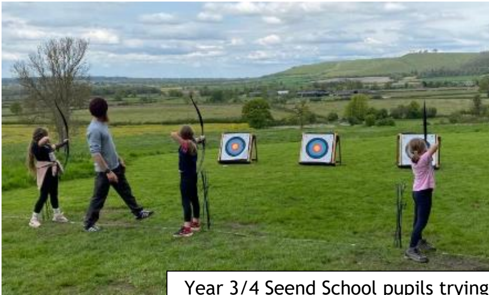
Year 3/4 Seend School pupils trying their hands at archery on a Braeside Residential, and other pupils in the 'Garden of Gethsemane' on the Holy Cross Church Easter Experience